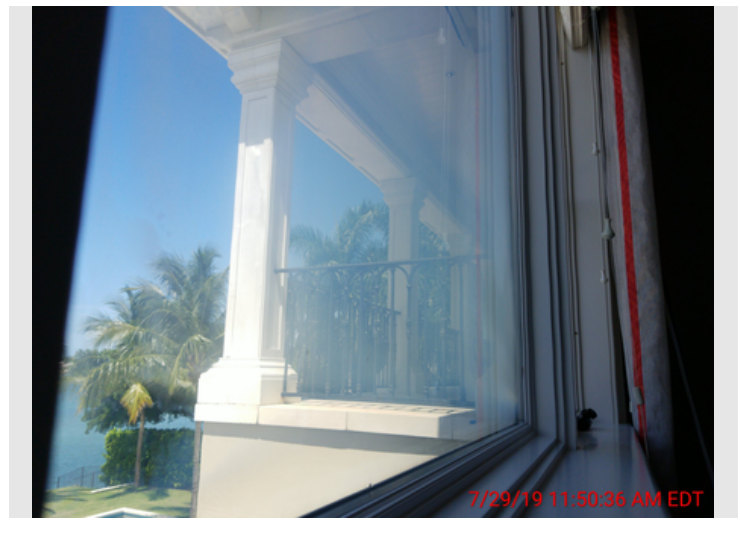
Description Window "EEE" fixed panel (Bedroom#3), close up photo

Job #: 39231 39231 Sullivan 2019 Loewen Windows 620 Admiralty Parade West Naples, Florida 34102