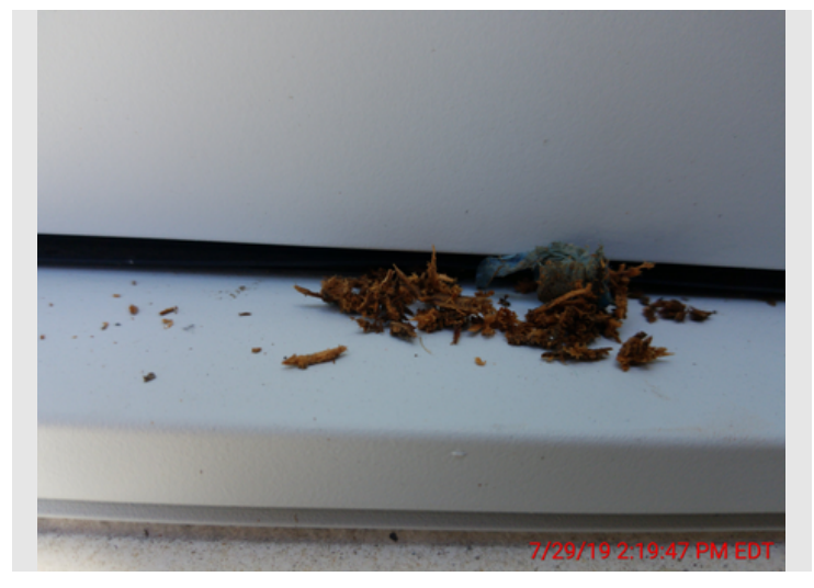
Description Window "C" fixed (two car garage), close up photo.