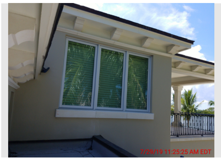
Description Window "VV" fixed (2nd Floor Sitting), No issues found.