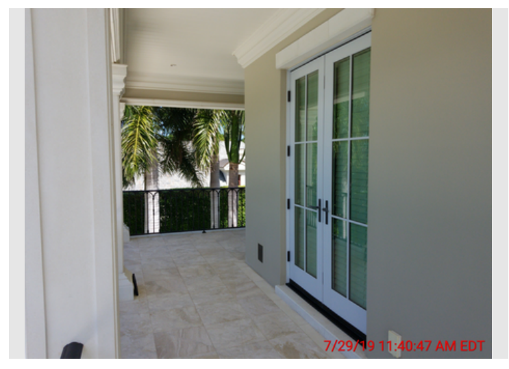
Description Door #60 (Master Suite), No issues found.