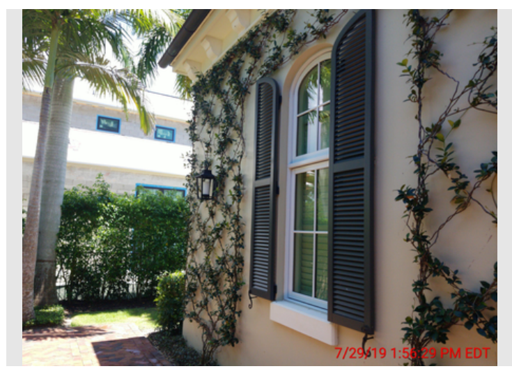
Description Window "UUU" fixed (BNK Rm), no issues found.