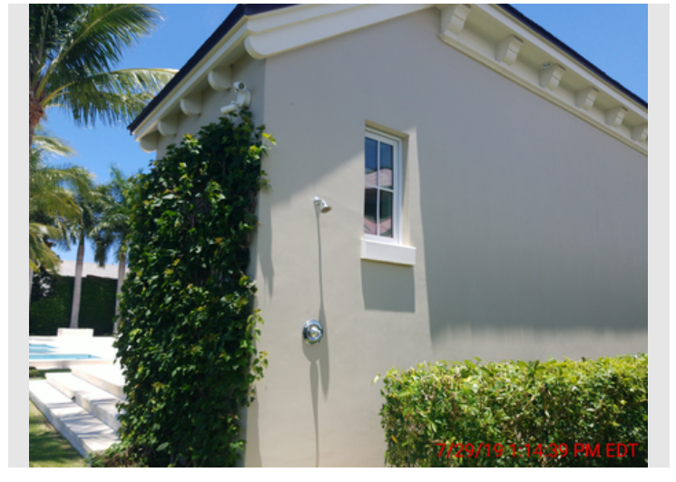
Description Window "WWW" fixed (Pool Bath), close up photo.