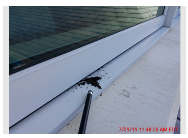
Description Window "EEE" casement/fixed (Bedroom #3), Close up photo 1 of 2.