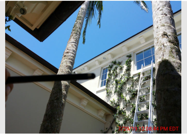
Description Window "FFF" fixed (Bathroom #3), No issues found.