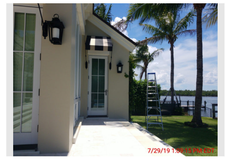
Description Door "26" (Pool Bath), no issues found.