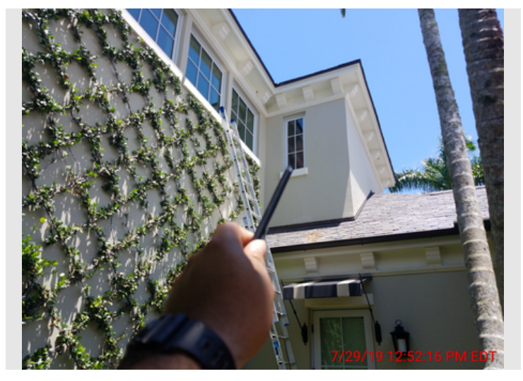
Description Window "MMM" fixed (Bathroom#5), no issues found.