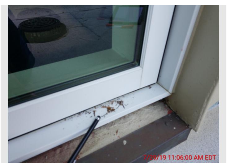
Description Window "PP" fixed (Open to Study), Close up photo.