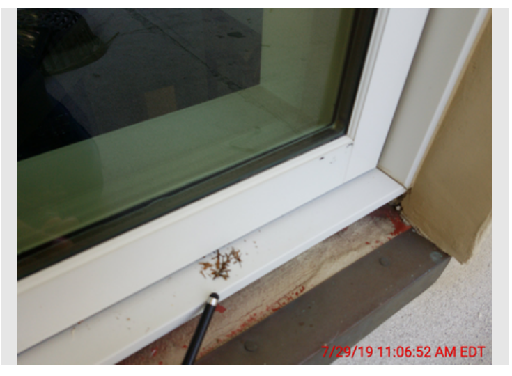
Description Window "RR" fixed (Open to study), Close up photo.