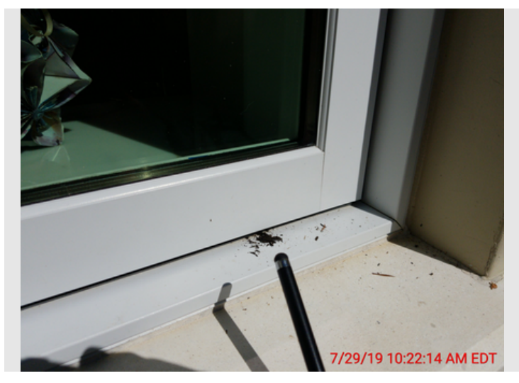
Description Window "U" fixed (Kitchen), Close up photo.