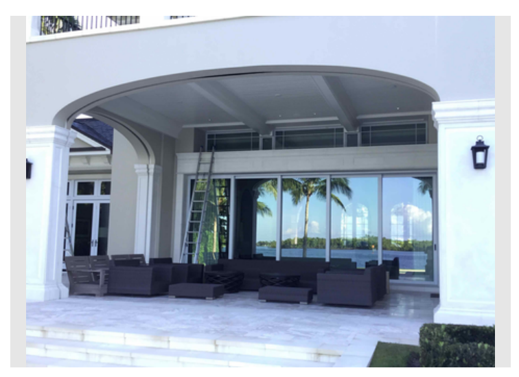
Description Sliding Glass Door #6 (Great Room), no issues found.