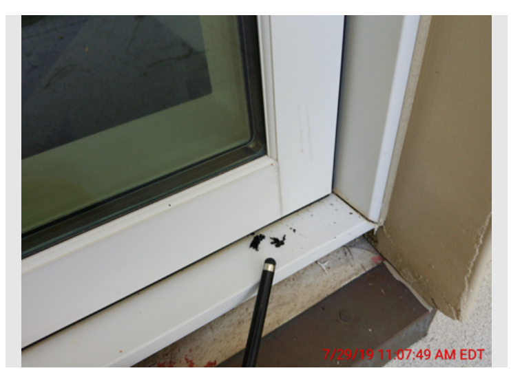
Description Window "SS" fixed (Open to study), Close up photo.