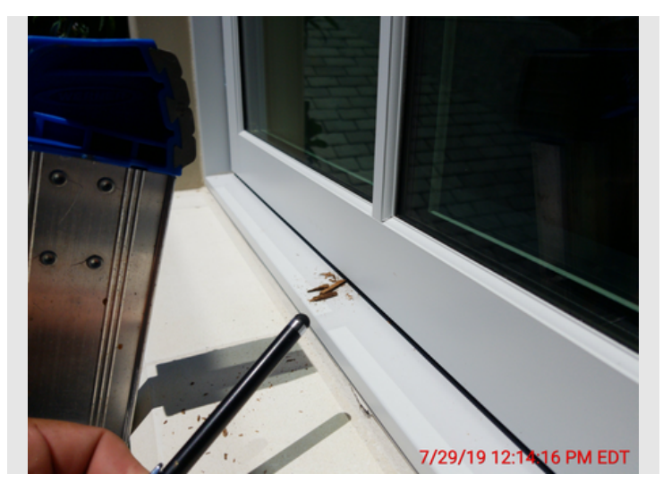
Description Window "HHH" fixed (East Stairway), Close up photo.