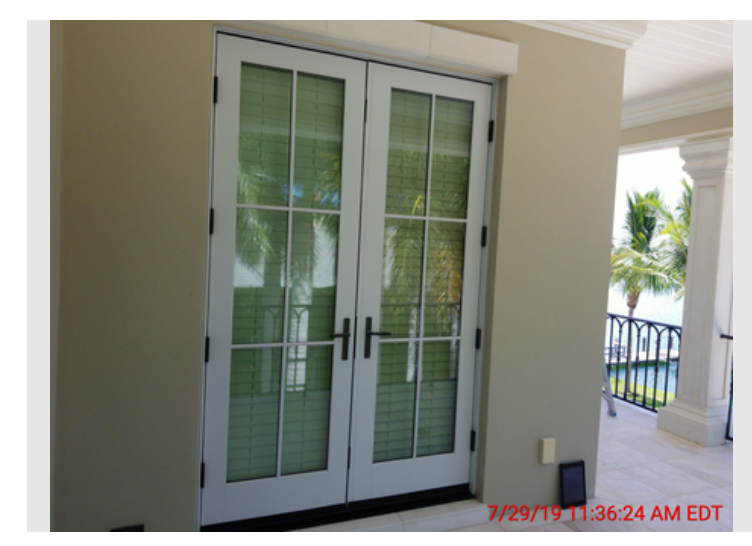
Description Door #59 (Master Suite), No issues found.